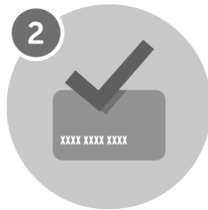
2 Add Funds