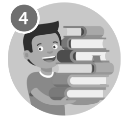
4 Shop the Fair

To get started, visit our school's Book Fair homepage: