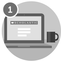
1 Create Account

Simply create an eWallet account and funds are instantly available for your child to shop the in-school Book Fair. Family and friends can contribute too and any unused balance can be spent at The Scholastic Store Online after the Fair.