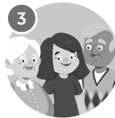
3 Share with Family and Friends